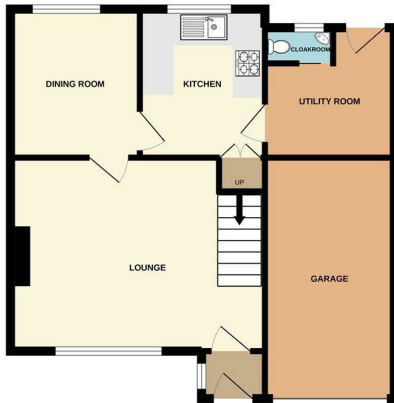
GROUND FLOOR 572 sq.ft. (53.1 sq.m.) approx.