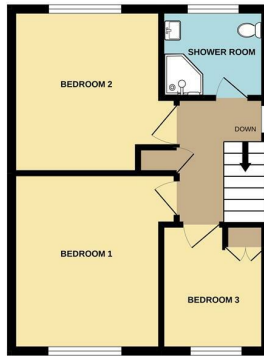
1ST FLOOR 363 sq.ft. (33.7 sq.m.) approx.